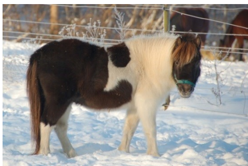
Thick coat and good bodily condition

All horses that are kept un-stabled around the clock in cold conditions during winter months should be prepared for this. They should have developed a thick coat and be in a very good bodily condition.