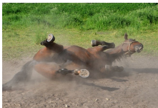
Rolling in sand