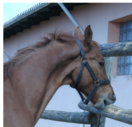
Crib biting is not necessarily preformed on the crib

Abnormal behaviours are seldom or never seen in horses that live under natural conditions. The development of abnormal behaviours is a sign that the environment and/or the conditions in which horses are kept do not fulfil their needs, and are thus indicative of a more or less compromised welfare. Many abnormal behaviours are stereotypies such as crib biting, wind sucking, stable walking, weaving, and auto-mutilation (biting themselves). Others may be normal behaviours which occur with an abnormal frequency such as aggressive behaviour and continuous biting on wood in a horse's accommodation. Development of abnormal behaviours differs between individuals. It is a misunderstanding that stereotypies are contagious. Horses that develop stereotypies may have the same stress level or the performance of some stereotypies may cause disturbance in the environment, which affect other susceptible horses.