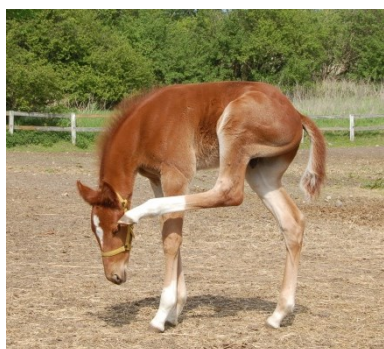
Scratching with a leg

Horses carry out different types of comfort behaviour. This behaviour serves different purposes such as a reaction to itching of the skin, to keep insects away, to keep the coat in a good condition, or for a social purpose. Comfort behaviour is exhibited even in horses who are groomed regularly. Comfort behaviour include nipping with the teeth, scratching with a leg (typically a hind leg), rubbing against an object, rolling in sand, mud, snow etc., followed by body and head shaking, and social grooming where two horses groom each other (typically on the withers or back).